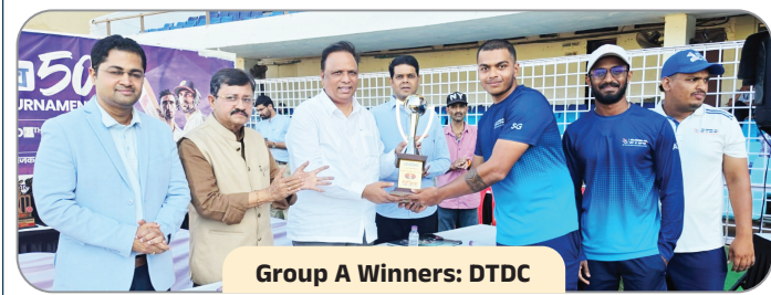
Group A Winners: DTDC