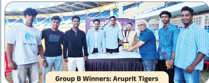
Group B Winners: Aruprit Tigers