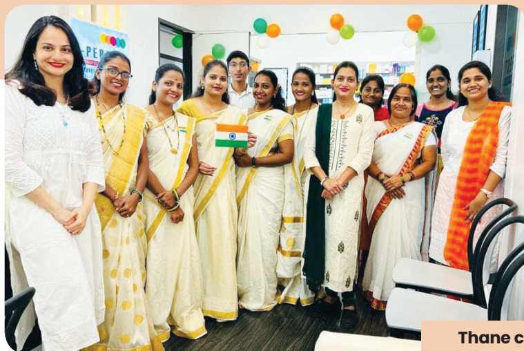
Thane clinic's staff