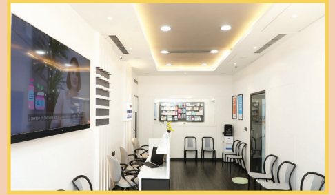
Plush waiting area at Thane clinic