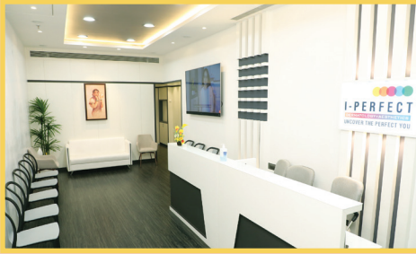
Plush waiting area at Thane clinic