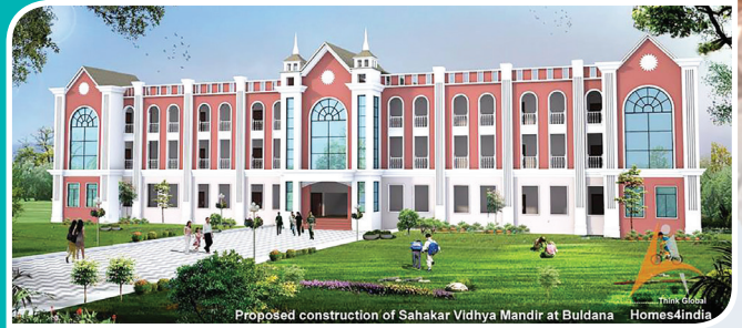
Proposed construction of Sahakar Vidhya Mandir at Buldhana Homes4India