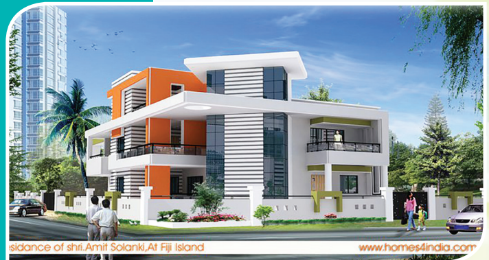
sidence of shri.Amit Solanki,At Fiji Island